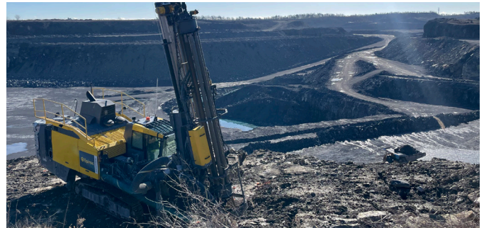
Quarry drill prepping a new bench.

Every year, the Ravenna plant ceases operations to allow for maintenance of critical plant machinery. Usually, we run all day, every day, which makes it difficult – if not impossible – to do in-depth upkeep and repairs. Our maintenance shutdown lasts for about week and offers the rare opportunity to get a look at some of our plant’s inner workings. Photographer Skip Dickstein was on hand for one of the shutdown days, and provided the following images: