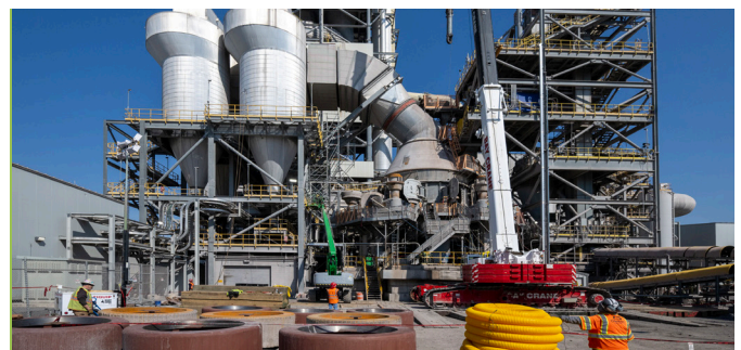
Repairing the roller mill.