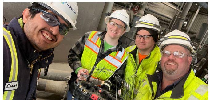
Holcim Ravenna’s reliability team prepares for the Elios inspection drone flight.